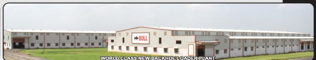
WORLD CLASS NEW BACKHOE LOADER PLANT

BULL MACHINES PVT.LTD., SF No.5/1A, L&T Bypass Junction, Trichy Road, Coimbatore - 641 103 INDIA Ph : 0422-3291 291 /3290 281/6575 753/98426 70184 Mob : 098422 87770 Email : sales@bullmachine.com; Net: www.bullindia.com