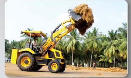
With Grabbing Fork/Bucket Handling Coil