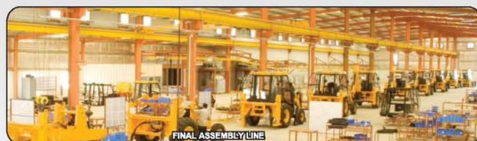
FINAL ASSEMBLY LINE