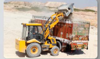
With Booster Bucket Loading Full Body Truck