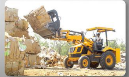
With HDHV Grabbing Fork Bucket Handling Paper Bale