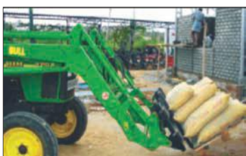
Loader for cement bags handling