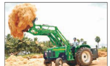
Loader for Coir handling