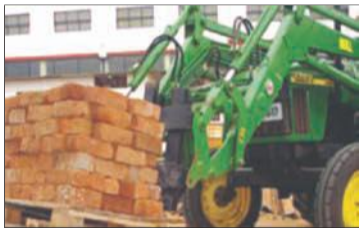
Loader for bricks handling

“Easy material handling using BULL - Tractor attachments for various applications with 40 types of Industry specific interchangeable bucket options”