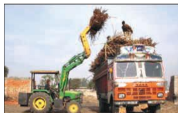
Loader for sugarcane handling