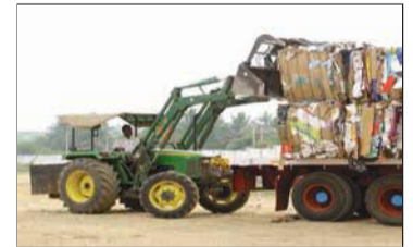
FEL with grabbing fork handling paper bales