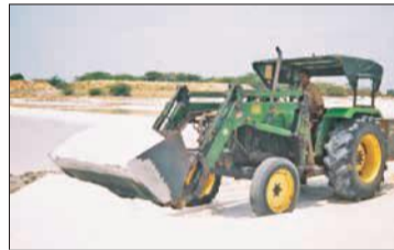
Loader at salt industry