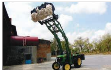
Ultra loader with 15.5 ft dump height for loose cotton handling