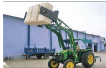
Loader for handling cotton bales