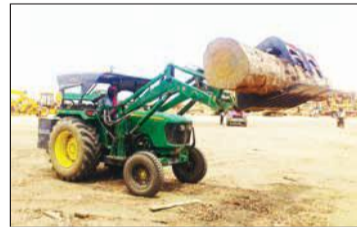
FEL with grabbing fork handling wood