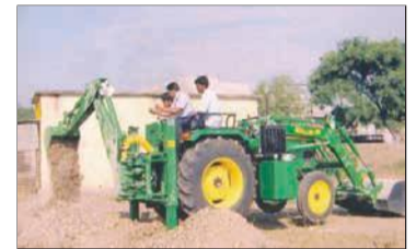
Backhoe Loader for excavation work