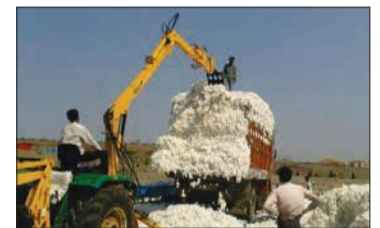
LRL with unloader unloading cotton