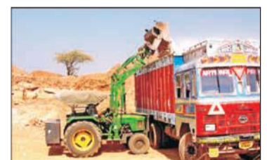
High Dumping @ 13.12ft tallest loader in India