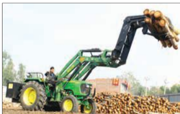
FEL with Sugarcane grabber handling wood