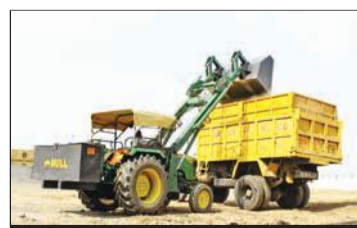
Telescopic Loader Loading Husk In Truck