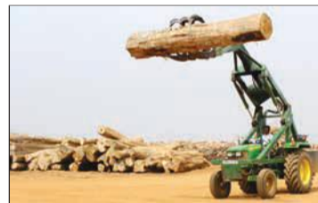
Ultra Sugarcane Loader Handling Wood