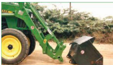
BQRSL mechanism Ease of bucket interchangeability