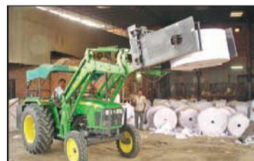
Loader with reel handling attachment on bale grabber