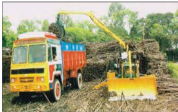
Radial loader for loading & unloading wood