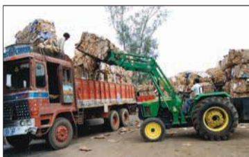
Loading Paper bales with fork lift