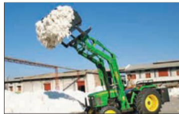
Loader for loose cotton handling